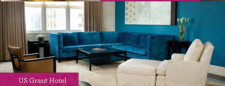
US Grant Hotel