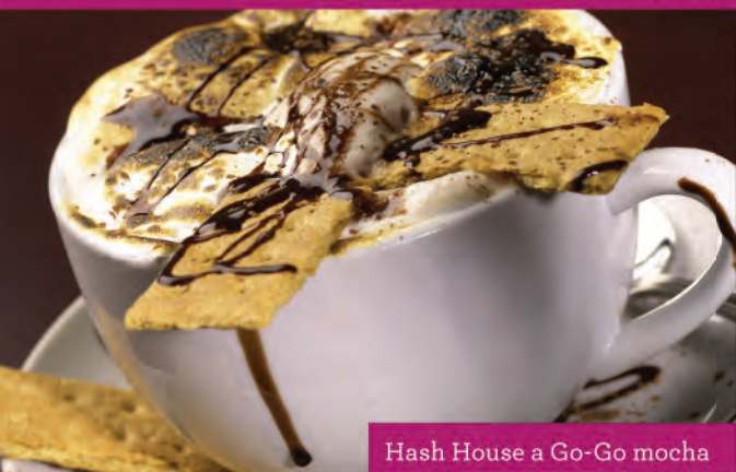
Hash House a Go-Go mocha