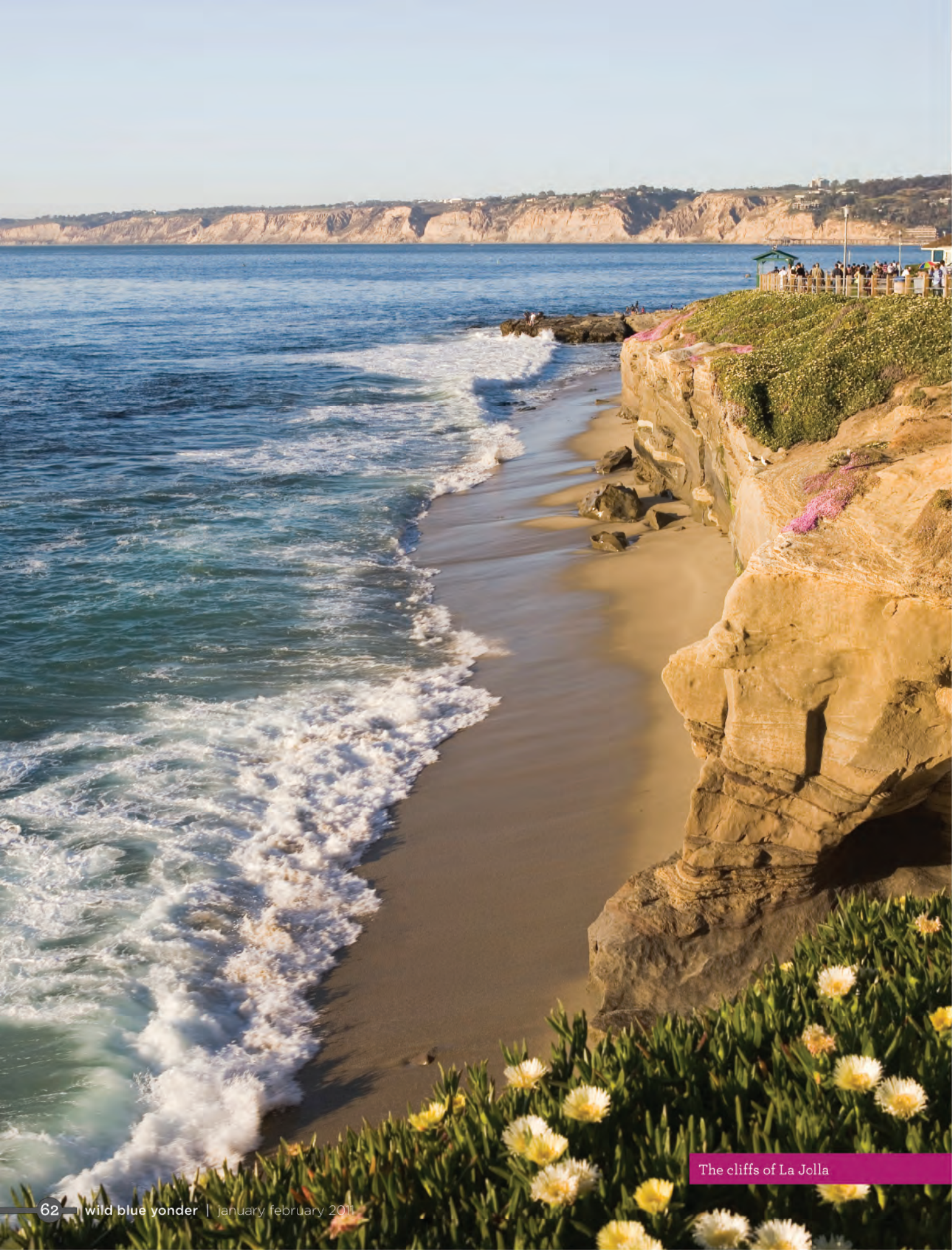
The cliffs of La Jolla