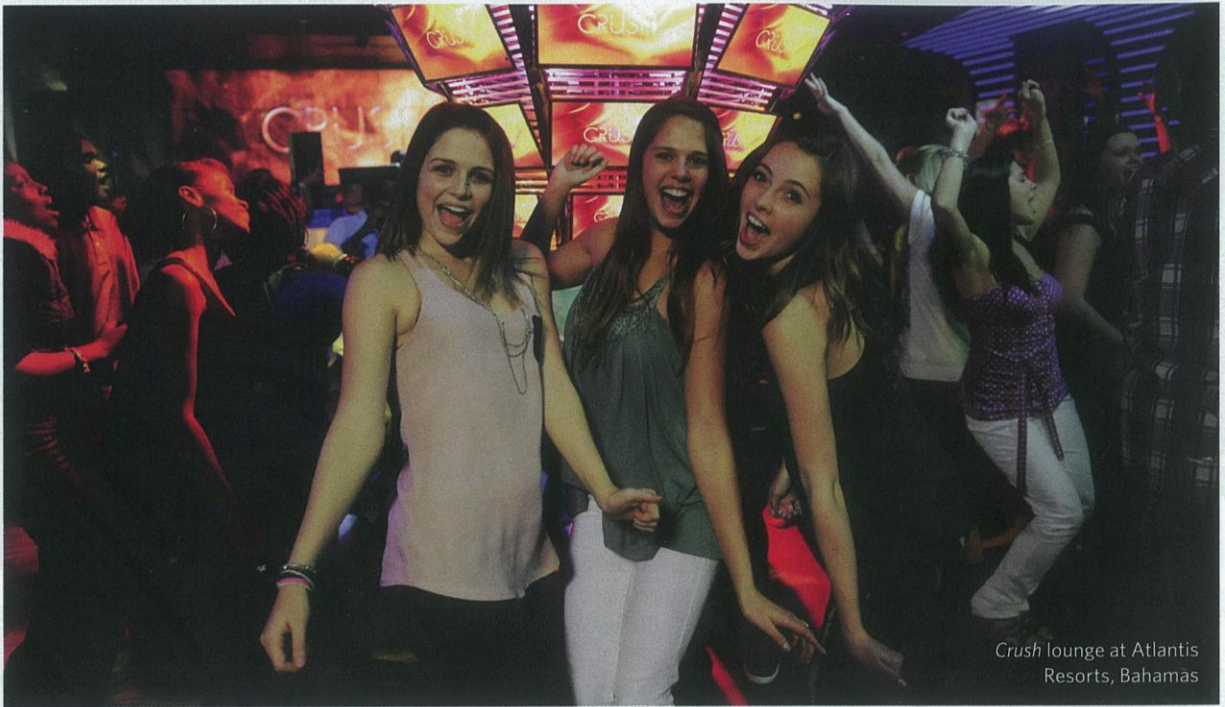
Crush lounge at Atlantis Resorts, Bahamas