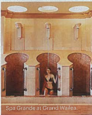
Spa Grande at Grand Wailea.

Size, in square feet, of Spa Grande at Grand Wailea, the largest spa in Hawaii.