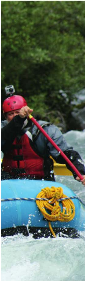
BARTHAHS LOUNGE HAPPY PHOTO